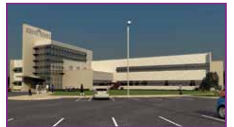
Kent State University Regional Academic Center in Twinsburg