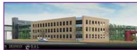
Bridgestone Parking deck rendering