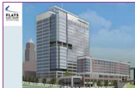
Flats East Bank rendering