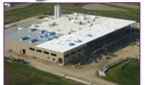
Shearer's Foods Inc. new building