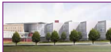
Bridgestone Technical Center rendering

The Ohio Manufacturers' ASSOCIATION WWW.OHIOMFG.COM