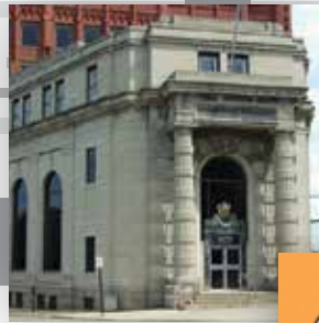
GOODYEAR HALL EAST END REDEVELOPMENT